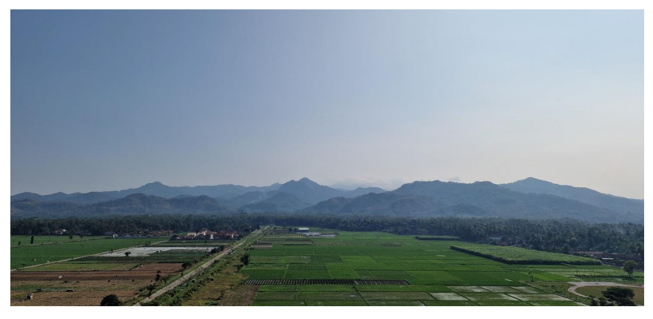
The Thousand mountains (Gunung Sewo) in the background of the surrounding plains