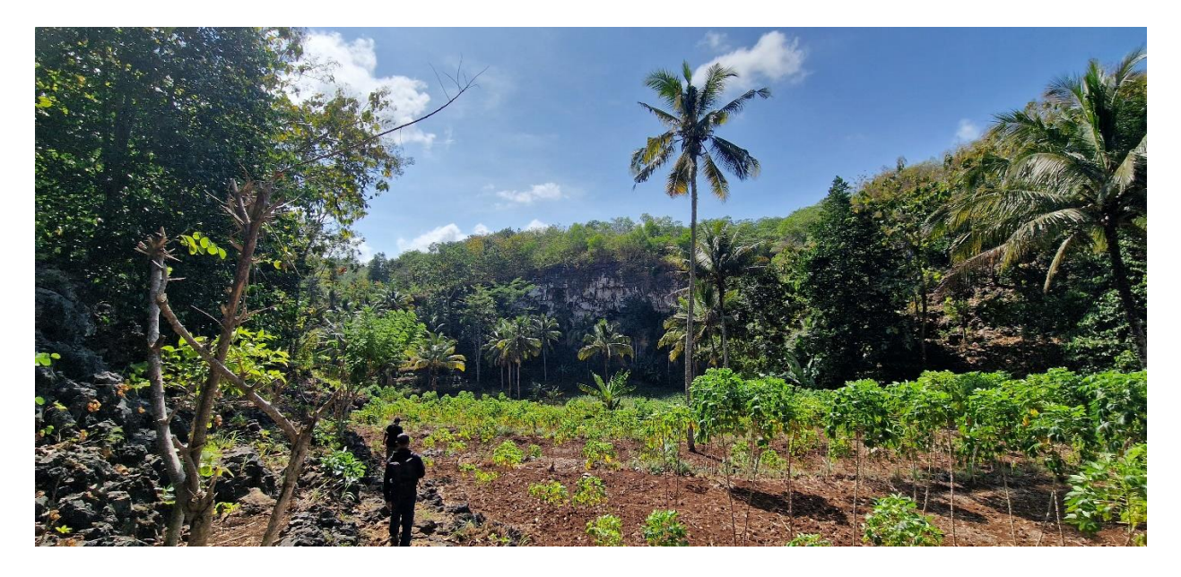
Main nesting and roosting site for Javan Sparrow in a farming region with scattered karst formations

Visiting the site, seeing the Javan sparrows and other threatened songbirds in the area was amazing but even more it was incredible to meet the local heroes who work every day to project their local biodiversity heritage.